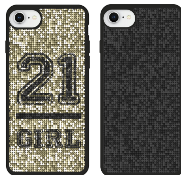
DOUBLE FACE CASE