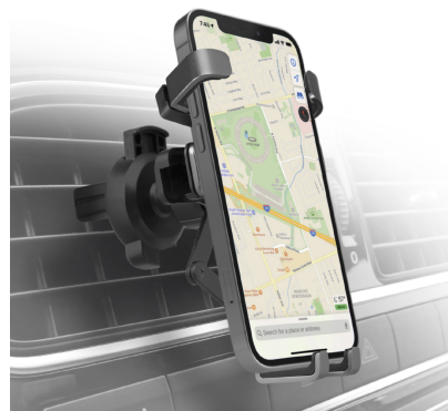
Chiusura automatica con meccanismo a gravità

Depth Pack: 60 mm Width Pack: 100 mm Depth Inner: 230 mm Height Pack: 200 mm Weight Pack: 115 g Width Inner: 200 mm Amount Inner: 6 Depth Master: 450 mm Height Inner: 170 mm Weight Inner: 860 g Width Master: 410 mm Amount Master: 48 Height Master: 370 mm Weight Master: 7955 g