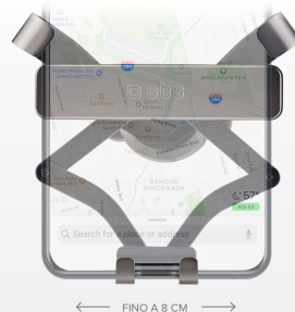
Supporto con clip orientabile e snodabile