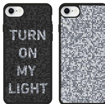
DOUBLE FACE CASE