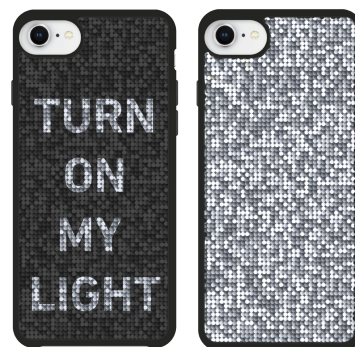
DOUBLE FACE CASE