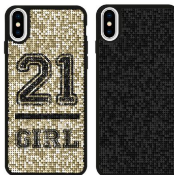
DOUBLE FACE CASE