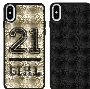
DOUBLE FACE CASE