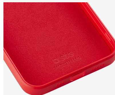
Materiale morbido e anti-urto per proteggere il tuo smartphone