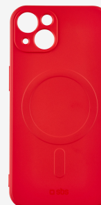
Design minimal e colorato

Depth Pack: 20 mm Width Pack: 100 mm Depth Inner: 140 mm Height Pack: 200 mm Weight Pack: 70 g Width Inner: 120 mm Amount Inner: 6 Depth Master: 580 mm Height Inner: 220 mm Weight Inner: 510 g Width Master: 380 mm Amount Master: 72 Height Master: 250 mm Weight Master: 7065 g