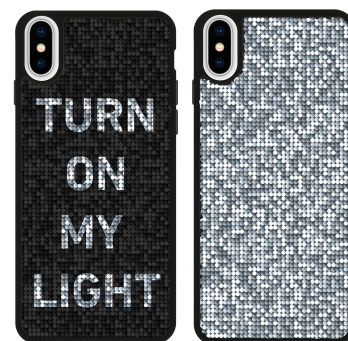
DOUBLE FACE CASE