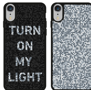
DOUBLE FACE CASE